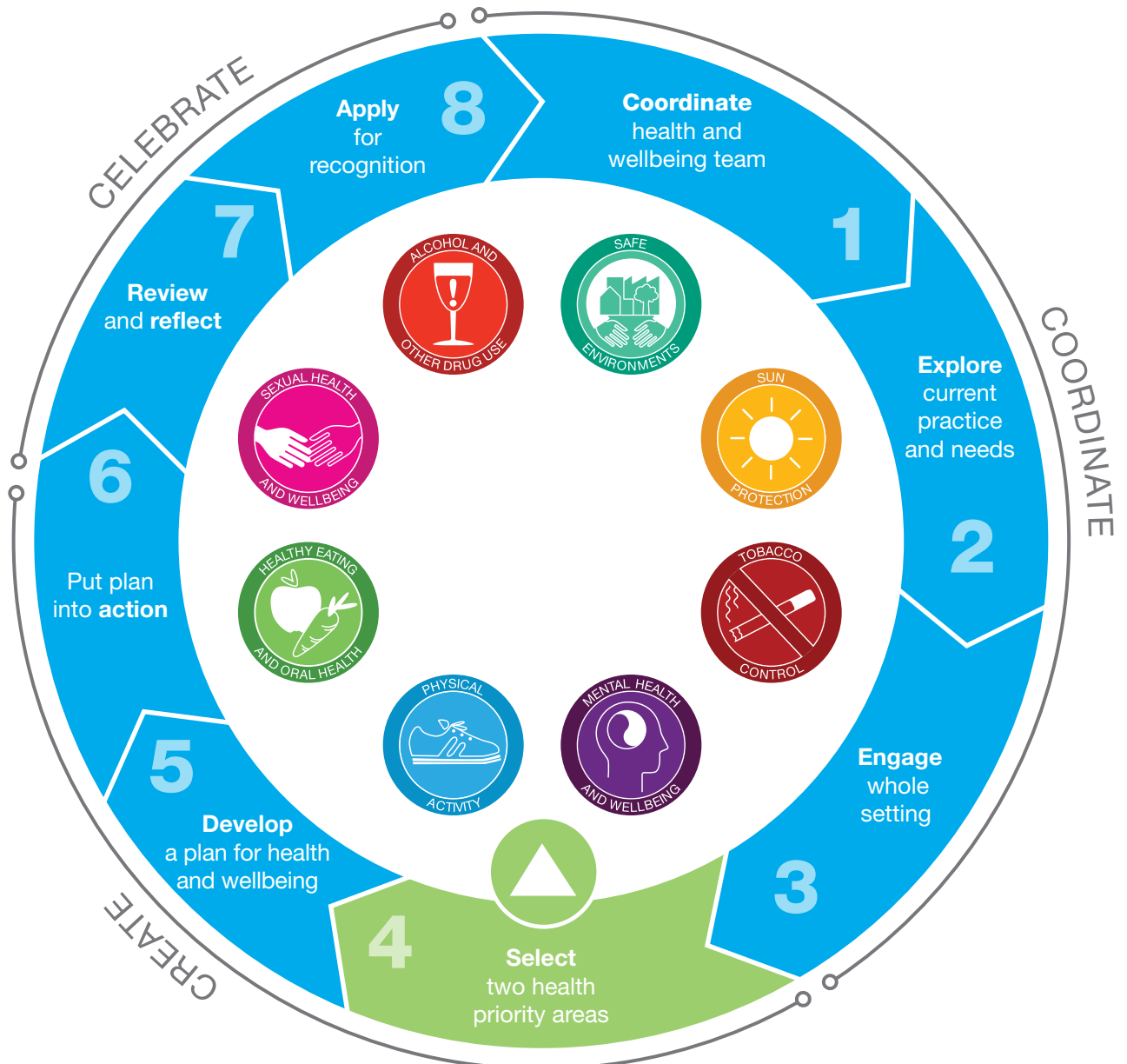
Figure 1: Working through the cycle