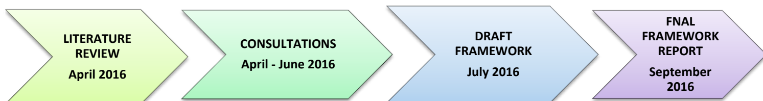
Figure 2. Timelines - Aboriginal Community Engagement and Partnership Engagement Framework.