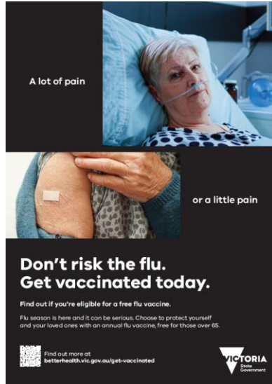
Seniors (over 65) Poster Download