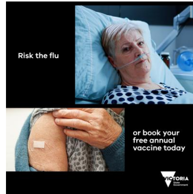
Seniors (over 65) Social Media