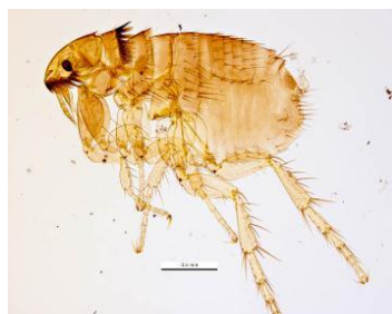
Figure 1 Flea

Fleas are small wingless external parasites from the Order Siphonaptera. Adult fleas range from 2 to 4mm in length, are brown in colour, and oval in shape. Their six legs are strong and spiny, with powerful hind legs for jumping. Relative to body size, fleas are one of the best jumpers of all animals and are able to jump over 200 times their body length.