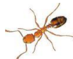
Figure 4 Pharaoh's Ant