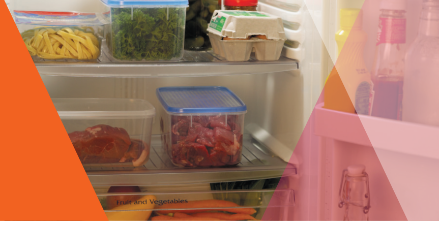
Use the fridge to thaw frozen food.