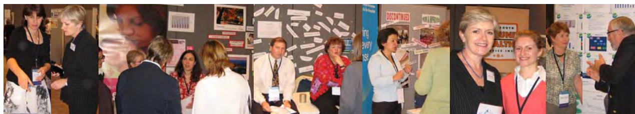
Innovation stall holders, from left, Goulburn Valley Health, Royal Women's Hospital, Seymour District Memorial Hospital, Royal Victorian Eye and Ear Hospital, Inner South Community Health Service and Melbourne Health.