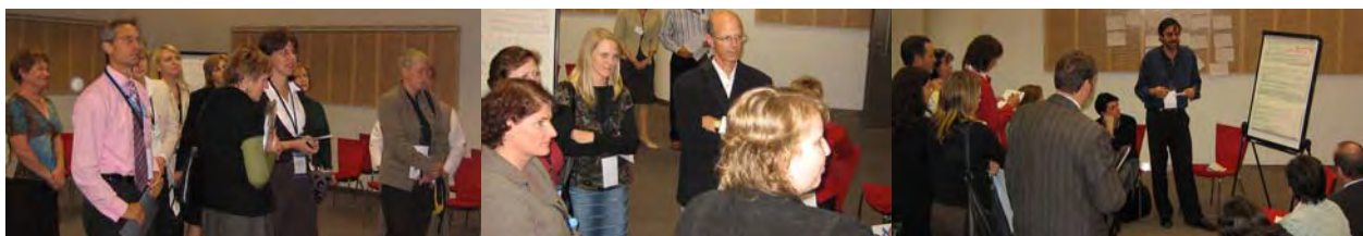
A study in consultation and participation. Delegates sharing ideas during the Consultation Day.