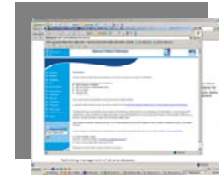
NHS Scotland: National Patient Pathways

As well as identifying the five practical actions that will make the greatest difference, it recommends how to go about implementing them and the order in which they should be done to achieve maximum effect.