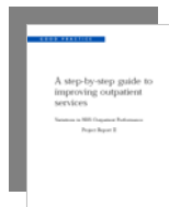
A step-by-step guide to improving outpatient services

Some of the recent additions are described below.