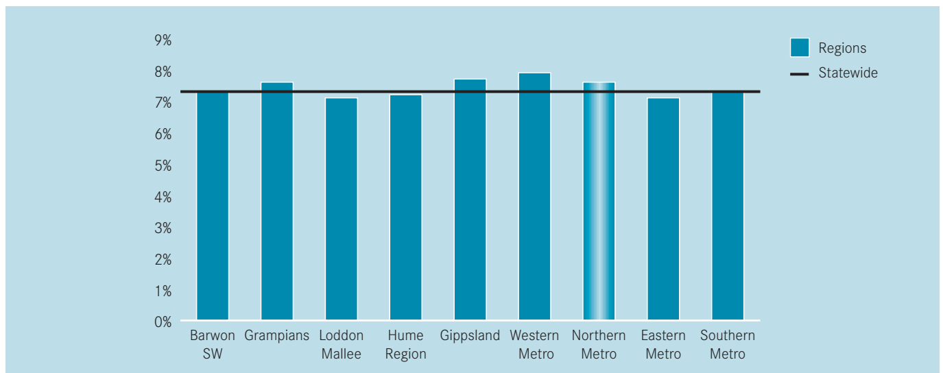
Preterm births in DHS Regions and statewide, 1993–2003